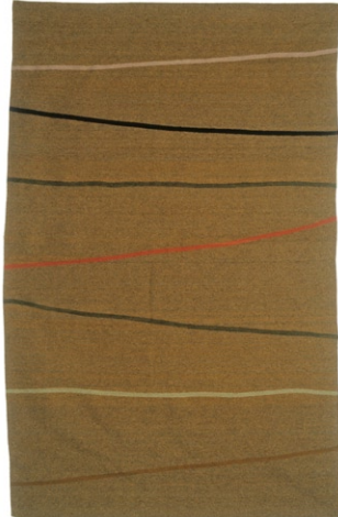
HIGH WIRE NATURAL